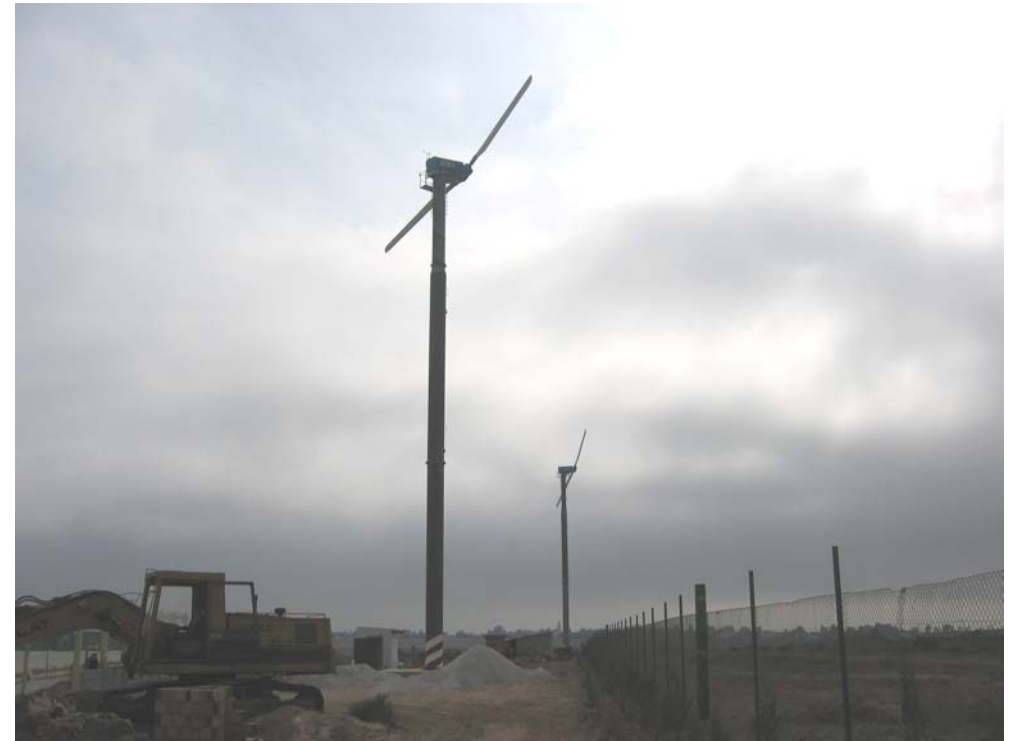
2 × WES<sup>18</sup> at shrimp processing facility, Tangiers, Morocco.