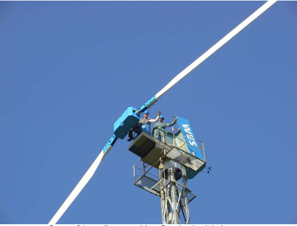
Successful installation on Nusa Penida island, Indonesia.