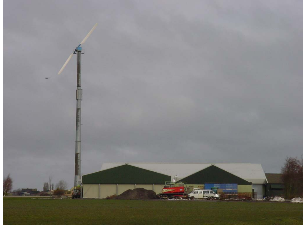
WES<sup>18</sup> at a farm, the Netherlands.