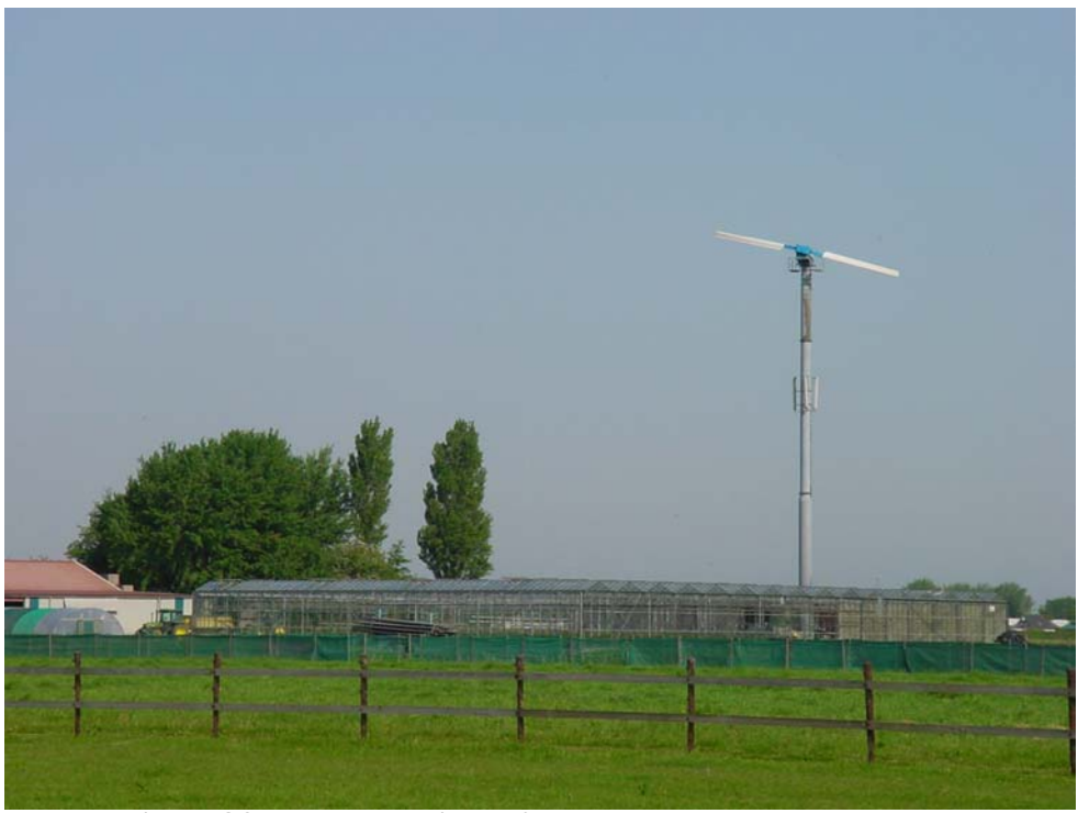
WES<sup>18</sup> (with GSM transmitter) at a flower bulb business, the Netherlands.