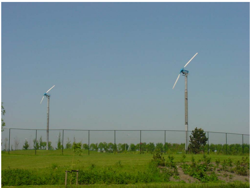
2 x WES<sup>18</sup> next to a golf course, the Netherlands.