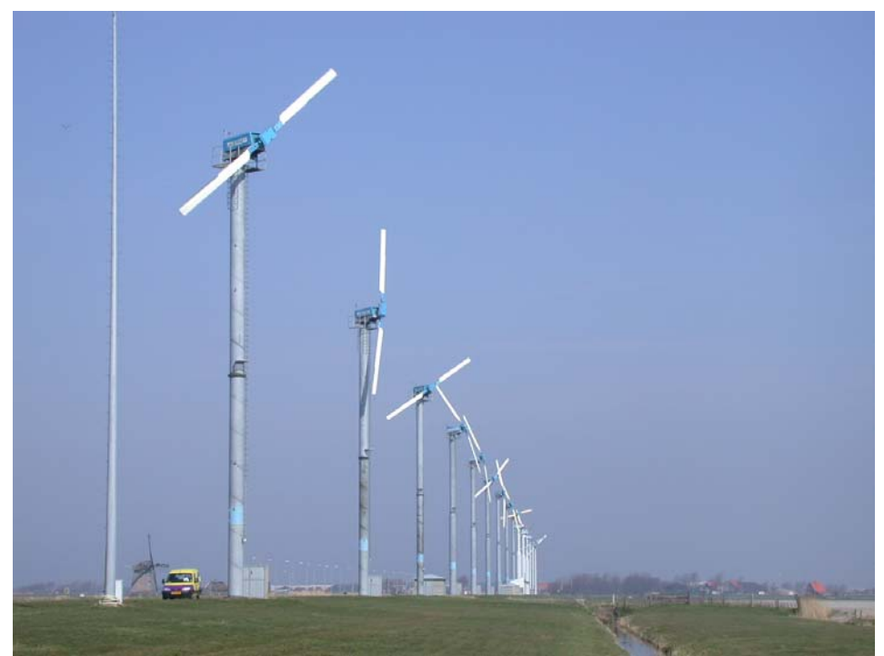
WES<sup>18</sup> wind farm, the Netherlands.