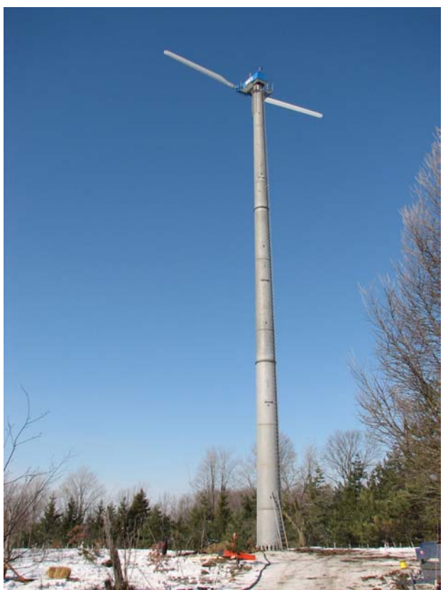
WES<sup>18</sup> in Ontario, Canada.