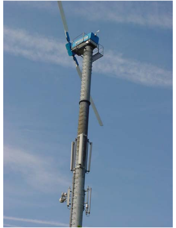
GSM transmitters on a WES<sup>18</sup>.