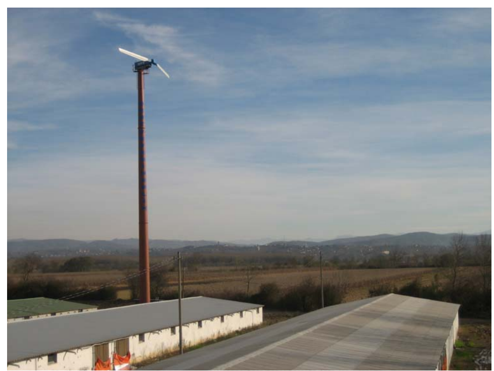
WES<sup>18</sup> at a poultry farm, Ferizle, Turkey.